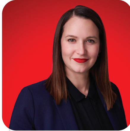
HON. SARAH STOODLEY