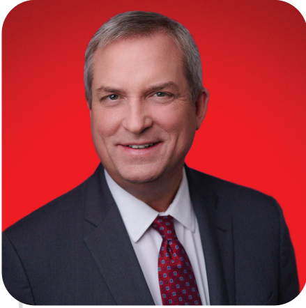
HON. GERRY BYRNE