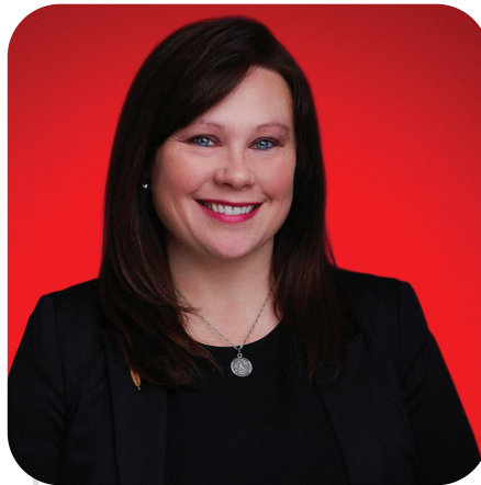
HON. PAM PARSONS