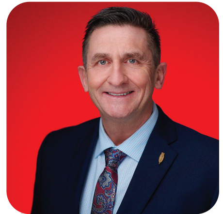
HON. DEREK BENNETT

Minister Responsible for Women and Gender Equality