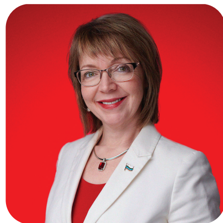
HON. LISA DEMPSTER

Minister of Tourism, Culture, Arts and Recreation Government House Leader