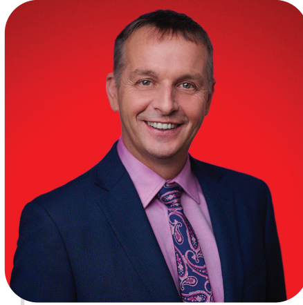
HON. DERRICK BRAGG

Minister of Immigration, Population Growth and Skills