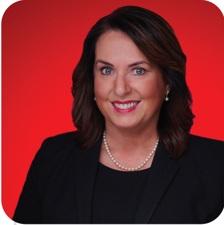
HON. SIOBHAN COADY