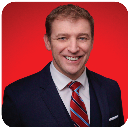
HON. ANDREW FUREY