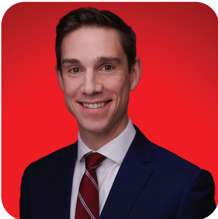
HON. JOHN HOGAN