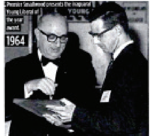
Premier Joseph Smallwood presented the inaugural Young Liberal of the Year Award in 1964.

We are very proud to have them as a dynamic partner and thank them immensely for all that they do to enhance our democratic framework, strengthen the Liberal team and keep us on the path forward to success.