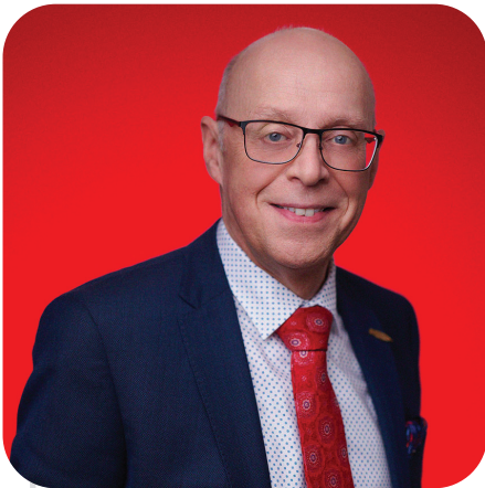
HON. JOHN HAGGIE

Minister of Transportation and Infrastructure Minister Responsible for the Public Procurement Agency