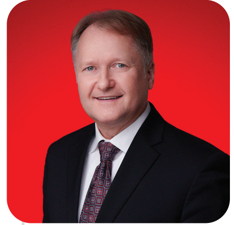
HON. ELVIS LOVELESS

Minister of Fisheries, Forestry and Agriculture