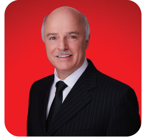
HON. TOM OSBORNE