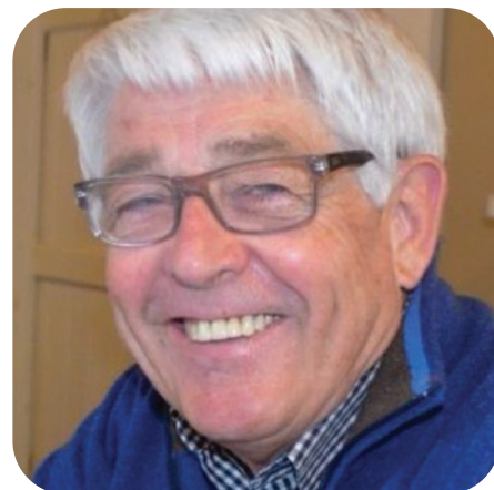
HON. SEAMUS O'REGAN